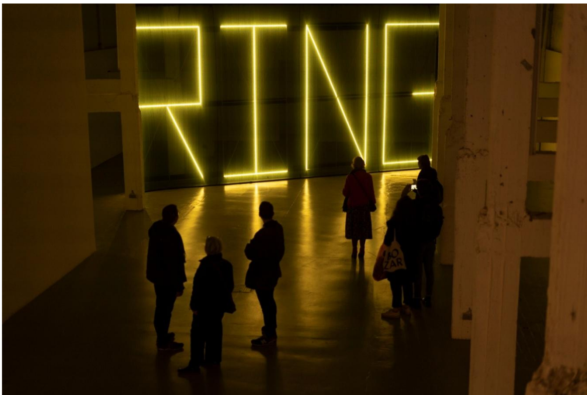
Four-Letter Film , 2004-2015 Install view, Beginnings , CAMP at Argos, Brussels, 2019.