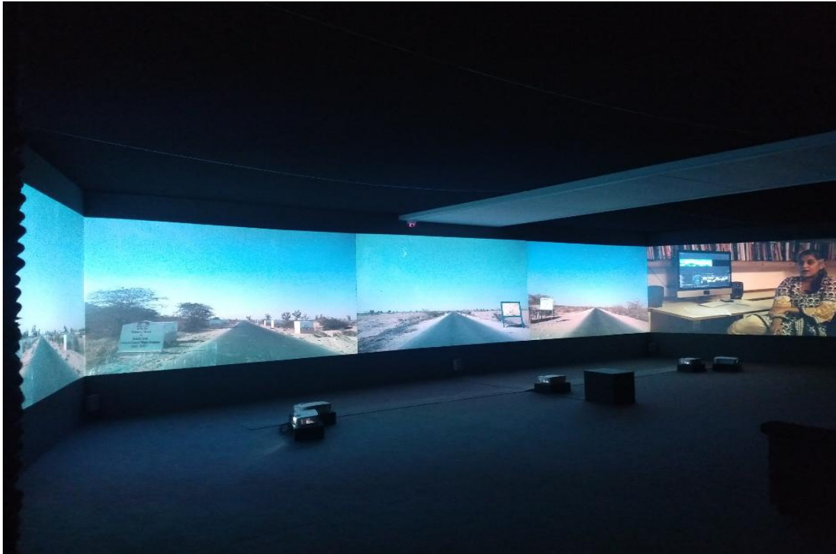
A Passage through Passages, 2020.

Part 3 Resource Frontier – Road to a coalfield, Tharparkar, Pakistan.