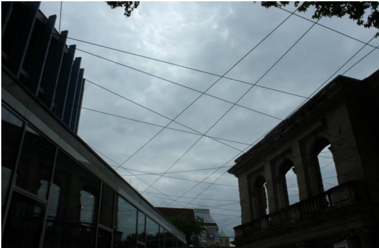
Matrix , 2017

Install view (partial), Experimenter , Kolkata, Originally commissioned by the Hindu for the Chennai Photo Biennale 2019.