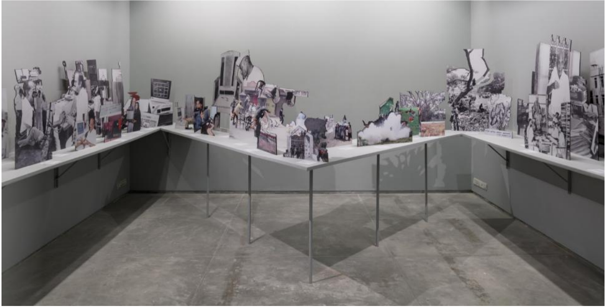
A Photogenetic Line , 2019

Install view (partial), Experimenter , Kolkata, Originally commissioned by the Hindu for the Chennai Photo Biennale 2019.